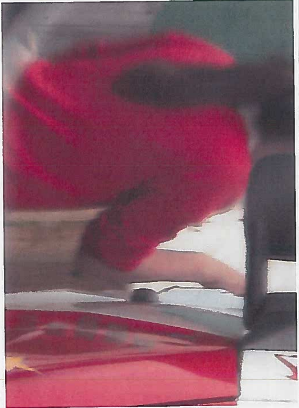
EXHIBIT NO: CR/2