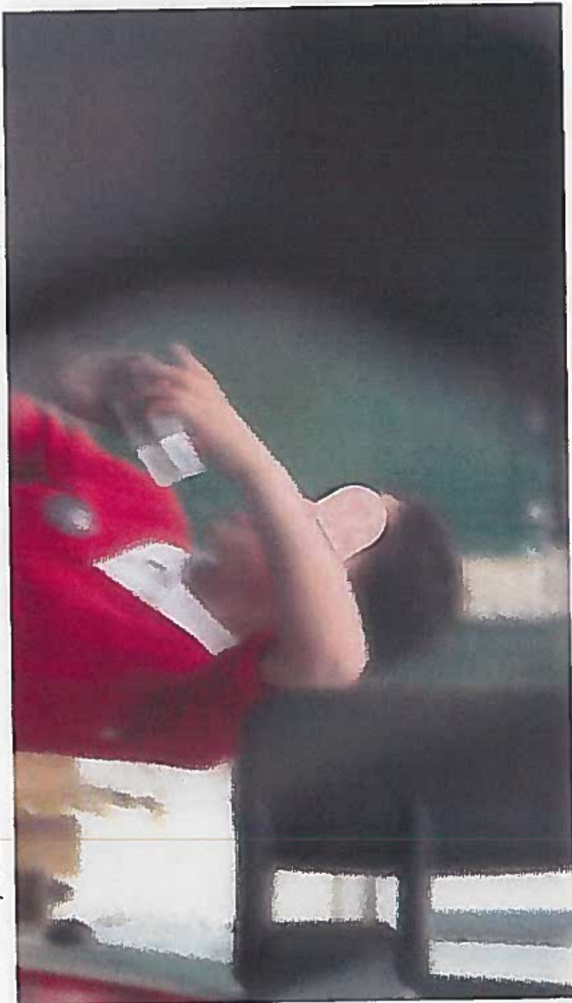
EXHIBIT No: CB/5