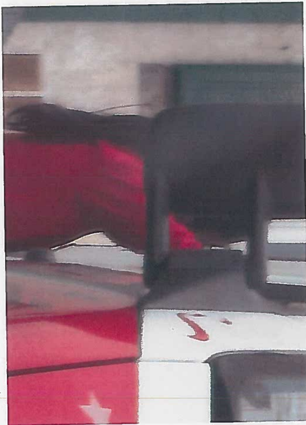
EXHIBIT NO: CB/3