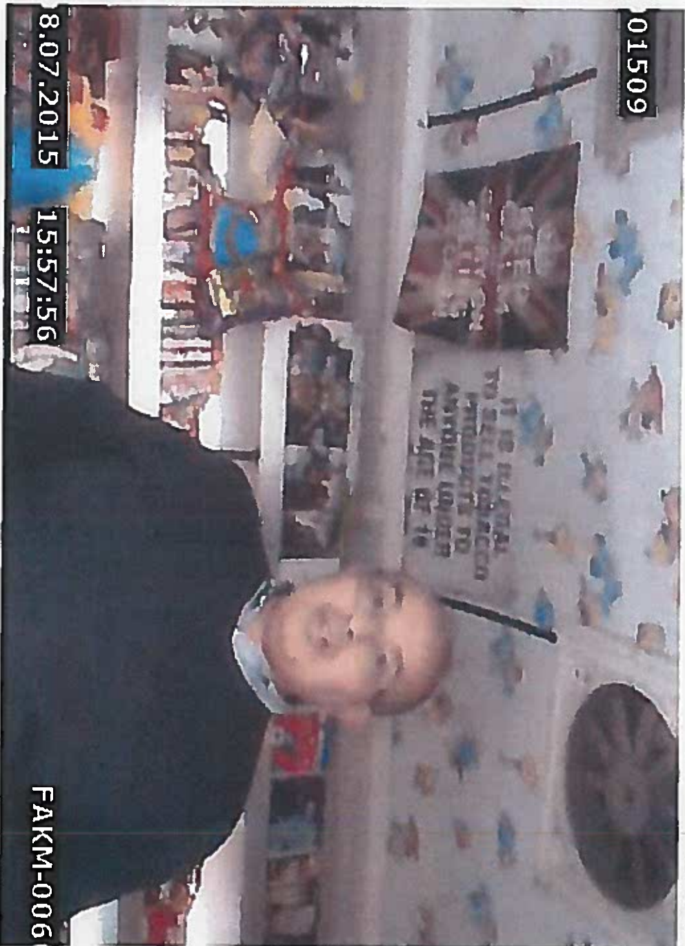
EXHIBIT No: CB/8