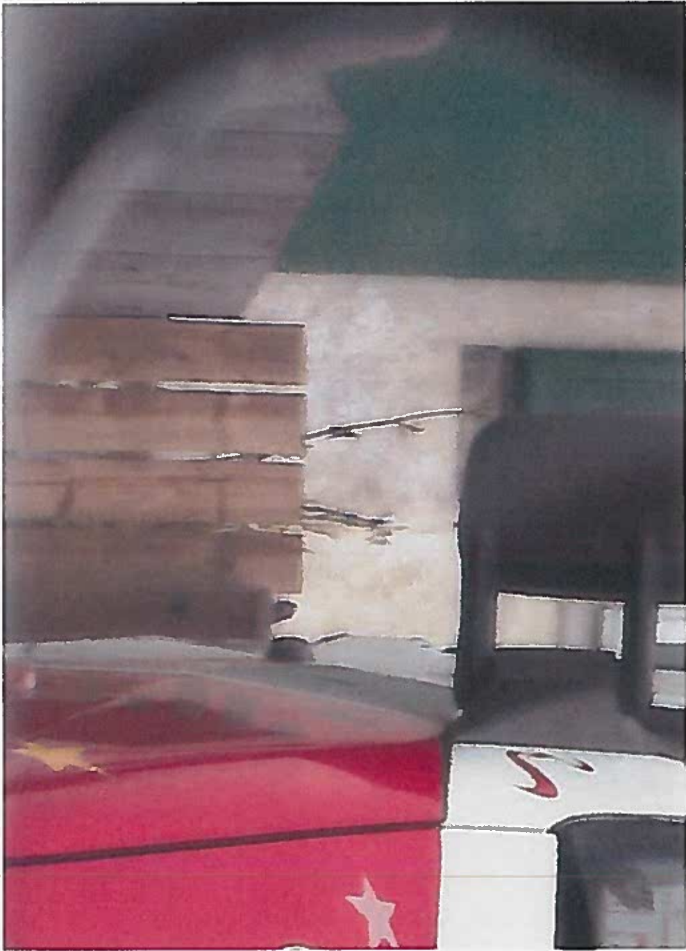
EXHIBIT NO: CB/1