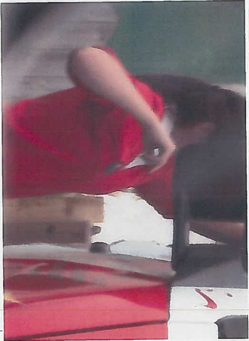
EXHIBIT NO: CB/4