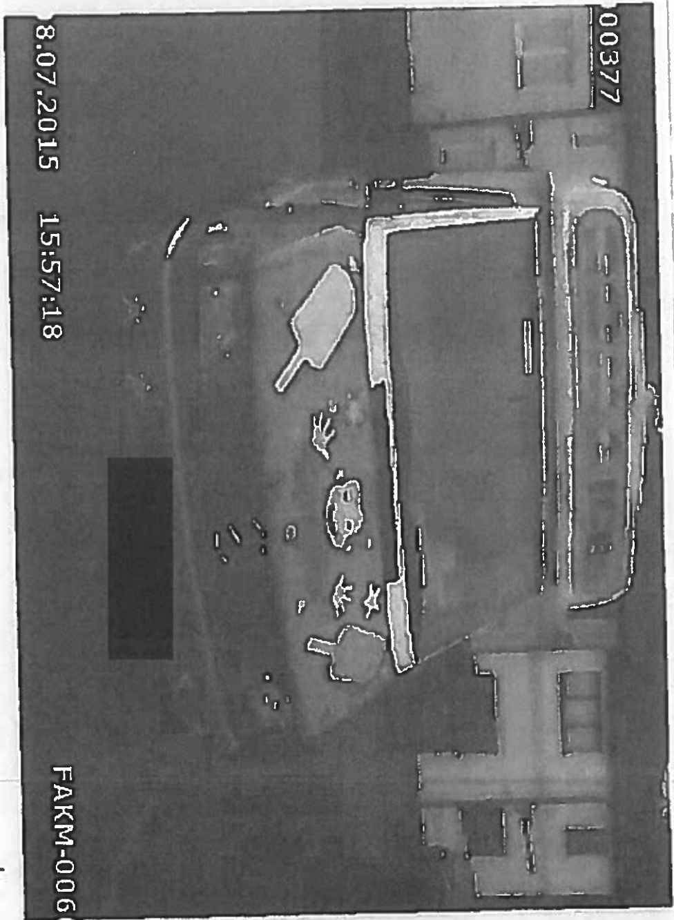
EXHIBIT No: 0816