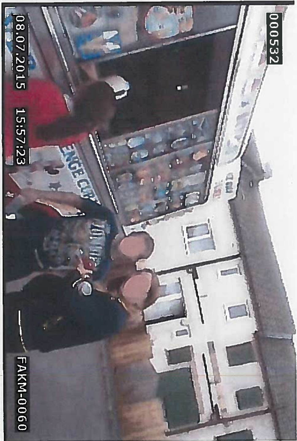
EXHIBIT No: CR/7